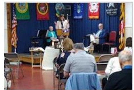
New Beginnings (MD)