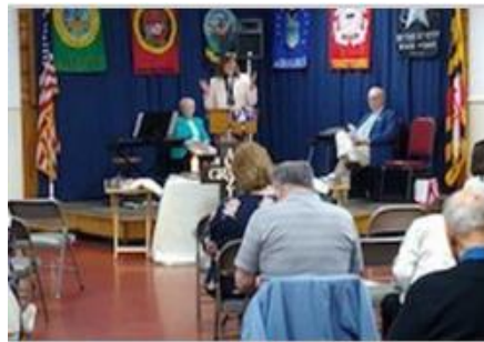
New Beginnings (MD)